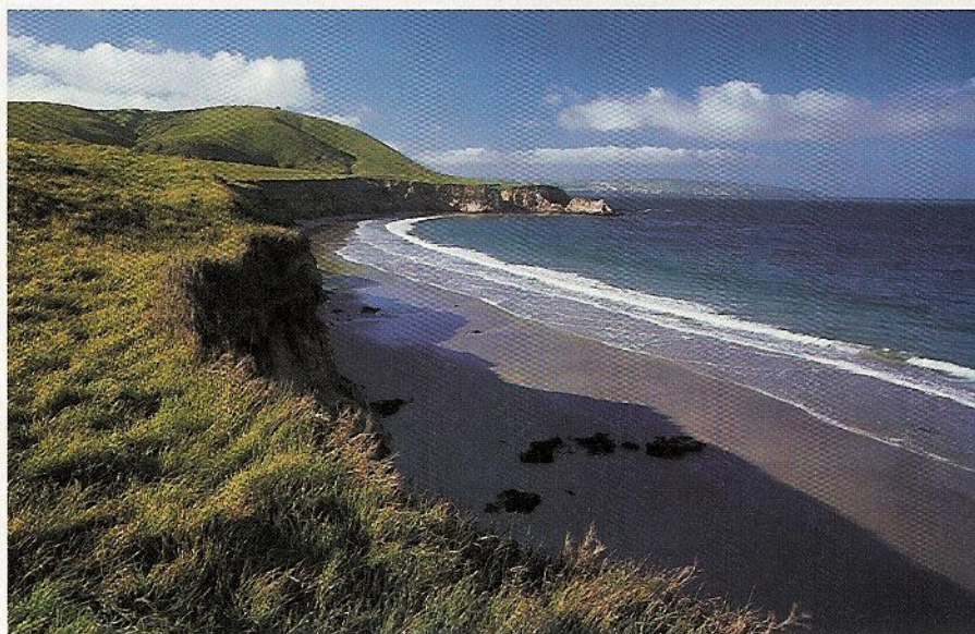
A window on the Ice Age: the land holds secrets on California's Santa Rosa Island.

Rocked by cold winds and ocean waves, 13 of us have endured a three-and-a-half-hour boat ride to cross the Santa Barbara Channel from Ventura, California. The island is one of five that make up Channel Islands National Park, an island chain that borders the Southern California coast like stepping stones. We've come as participants in one of several field trips offered each year by the park and the Santa Barbara Museum of Natural History. We're spending four days in the company of anthropologists, archaeologists, and paleontologists as they explore this 15-mile-long, 10-mile-wide time warp.